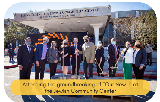
Attending the groundbreaking of "Our New J" at the Jewish Community Center

Village News/Southwest News | June 15, 2021