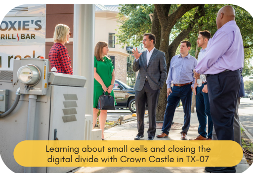
Learning about small cells and closing the digital divide with Crown Castle in TX-07