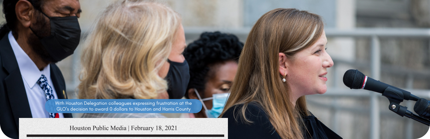
With Houston Delegation colleagues expressing frustration at the GLO's decision to award 0 dollars to Houston and Harris County

Houston Public Media | February 18, 2021