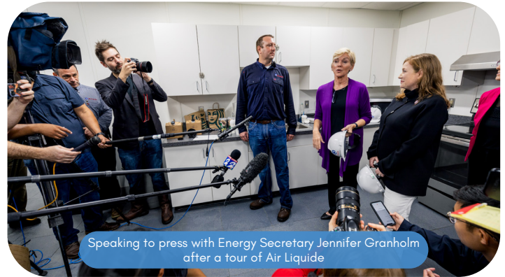
Speaking to press with Energy Secretary Jennifer Granholm after a tour of Air Liquide