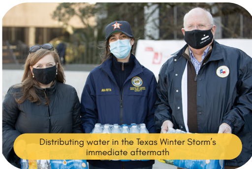
Distributing water in the Texas Winter Storm's immediate aftermath

wrote Congresswoman Fletcher. "Many of my constituents rely on the USPS for lifesaving medications, stimulus checks, tax refunds, and correspondence with loved ones in this challenging and isolating time... Houstonians cannot wait for meaningful changes at the North Houston P&DC nor should they have to continue without remedy as mail is stolen and accessible services are removed."