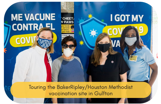
Touring the BakerRipley/Houston Methodist vaccination site in Gullfion