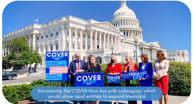
Announcing the COVER Now Act with colleagues, which would allow local entities to expand Medicaid