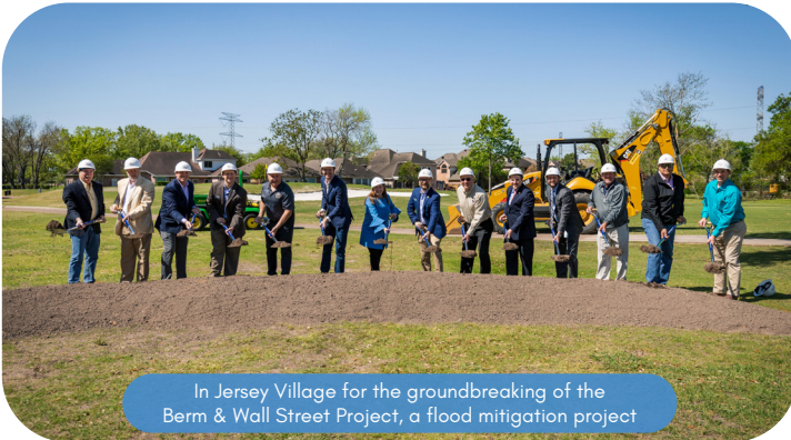
In Jersey Village for the groundbreaking of the Berm & Wall Street Project, a flood mitigation project