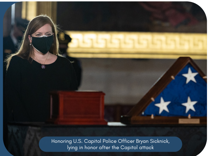
Honoring U.S. Capitol Police Officer Bryan Sicknick, lying in honor after the Capitol attack

Our work to investigate that day continues, from uncovering the series of events that led up to the attack to make sure this can never happen again, to honoring the Capitol Police who risked and sacrificed their lives to protect our democracy.